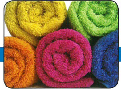
Better in the laundry.