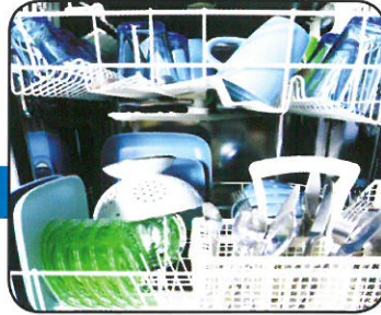
Better in the kitchen.