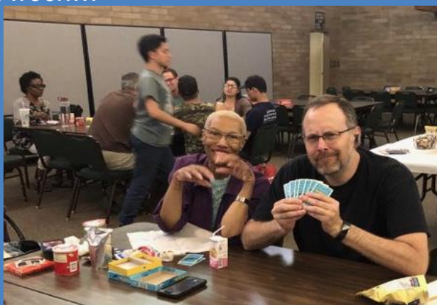
Freedom Fest 2019