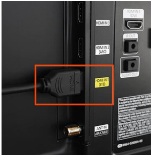
Step 4: Connect HDMI Adapter to your TV