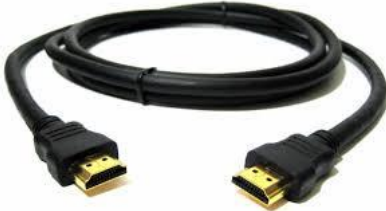
Step 3: Connect Lightning Digital A/V Adapter into standard HDMI Adapter