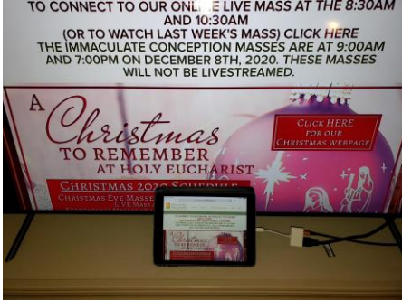
Step 6: Watch iPhone contents on your TV