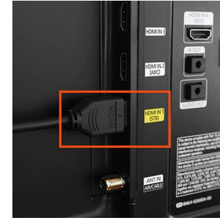
HDMI port on TV

Step 1: Connect a USB-C to HDMI Adapter to the USB port on Android phone