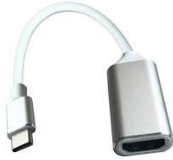
USB-C to HDMI Adapter