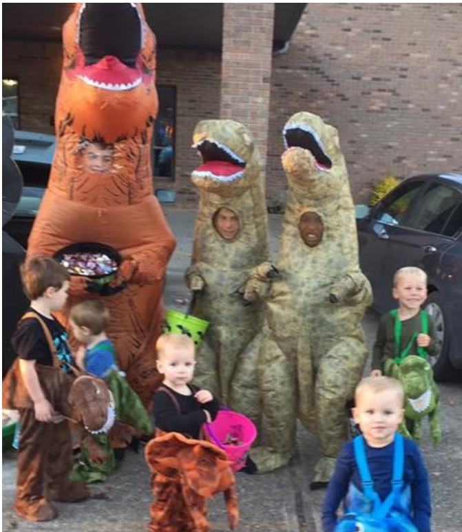
Our herd of dinosaurs at Trunk or Treat!!

Our monthly Ministry Meeting is tomorrow, Monday, November 5th at 7pm.