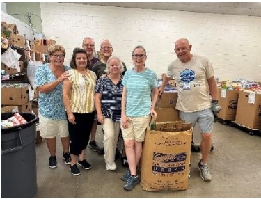
Six volunteers helped sort food at Greensboro Urban Ministry on Friday, July 25.

8 volunteers are needed (ages 12 and up) Contact Judy Newlin at newlinjf@gmail.com if you can pick up, serve and clean up for the meal at Weaver House, 305 W. Gate City Blvd.