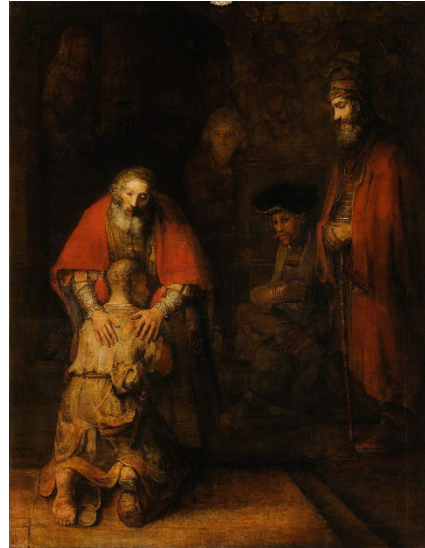
Return of the Prodigal Son by Rembrandt