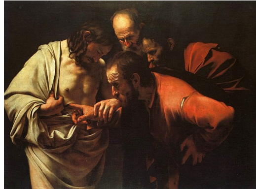
"The Incredulity of Saint Thomas" by Caravaggio (1601)

Today is the 5 th Sunday of the season of Easter. Within the Church, the meaning of the resurrection of Jesus Christ is far too big to be celebrated on one day only – so Easter is not just a Sunday, but a season of 50 days in which we celebrate Jesus' resurrection. In a way, every Sunday, all throughout the year, is a little Easter in which we celebrate Christ's victory over death. Today in worship we will read a story about how the risen Jesus appears to the disciple who is often referred to as "doubting Thomas." In a stand-alone message, we will hear a few stories from our recent mission trip to Western NC, as well as an invitation to humbly acknowledge all that our limited minds cannot know or understand about our world – as well as the importance of doubting our doubts.