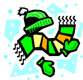
It is cold outside!

Thanks for helping us keep the children safe and warm!