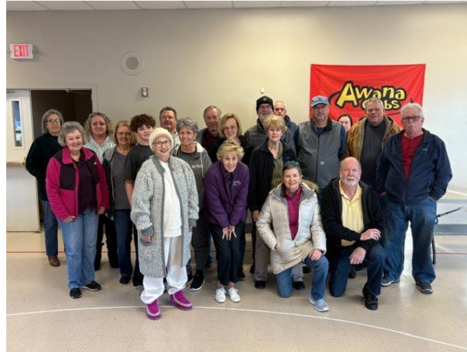
VOLUNTEERS ON JANUARY 20 FOR DAN RIVER FOOD DISTRIBUTION AT KENTUCK MINISTRY CENTER