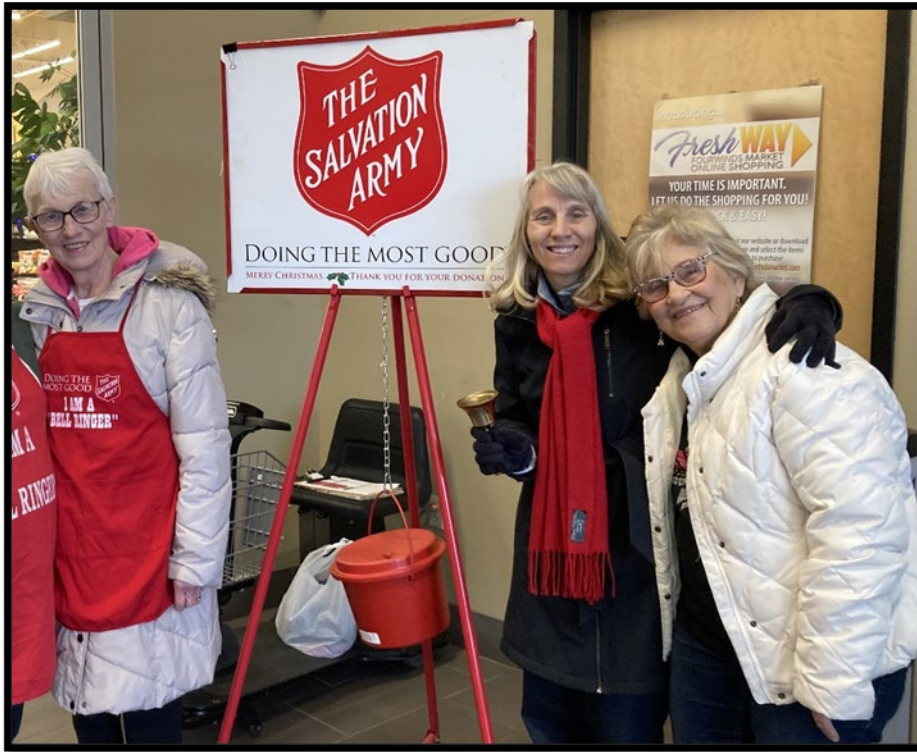
CHRISTMAS ACTIVITIES! Bell Ringing - Community Christmas Celebration for Kids!