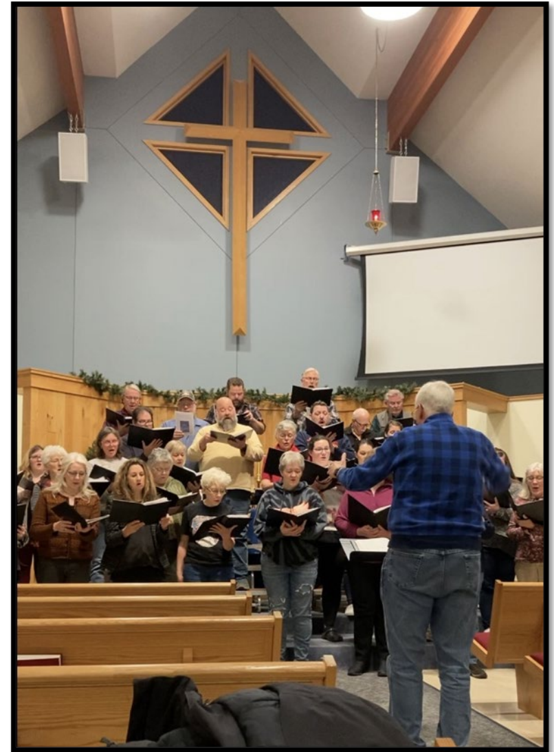
Community Christmas Concert! A yearly Event!