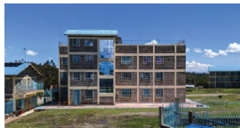
A safe place, Hope Children's Center.