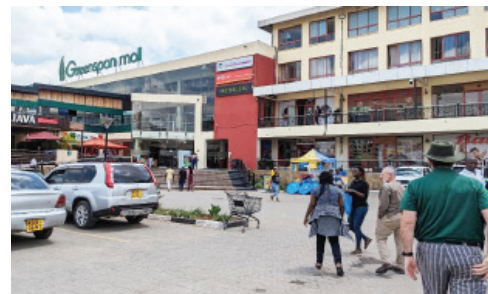
An upscale Nairobi shopping mall