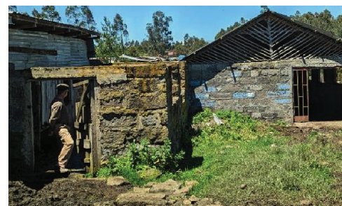
"Homes" by the side of the road