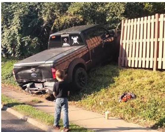
What prompted the traffic calming efforts?

For several years, a number of College Hill residents have been working with city and county experts on "traffic calming" options. In the next months, the current installations will change. North Bend Road will be repaved in 2025 and changes can be made until then.