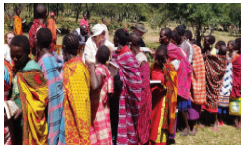
Colorful Maasai gathered for worship