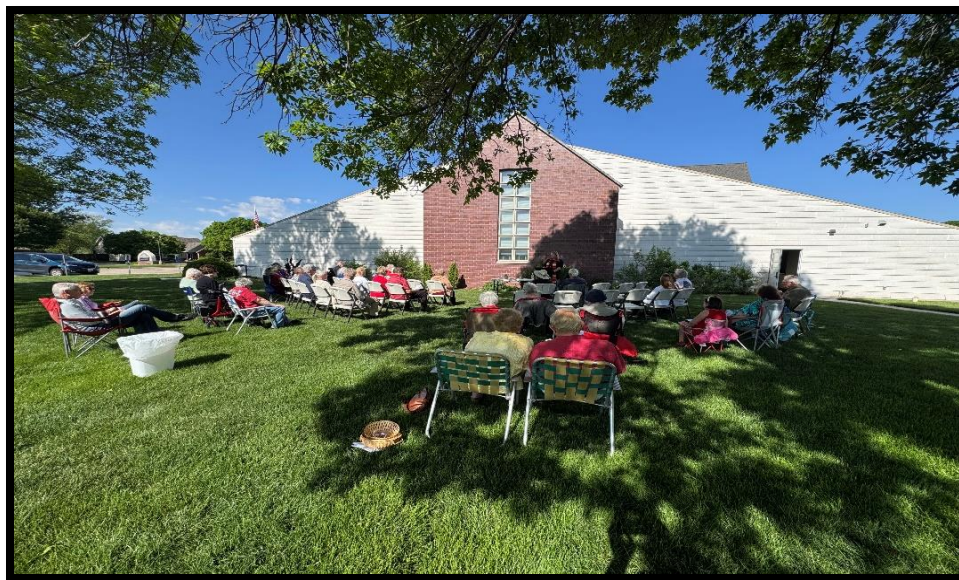
May 24 th Outdoor Worship

Thank you for your help with this project!