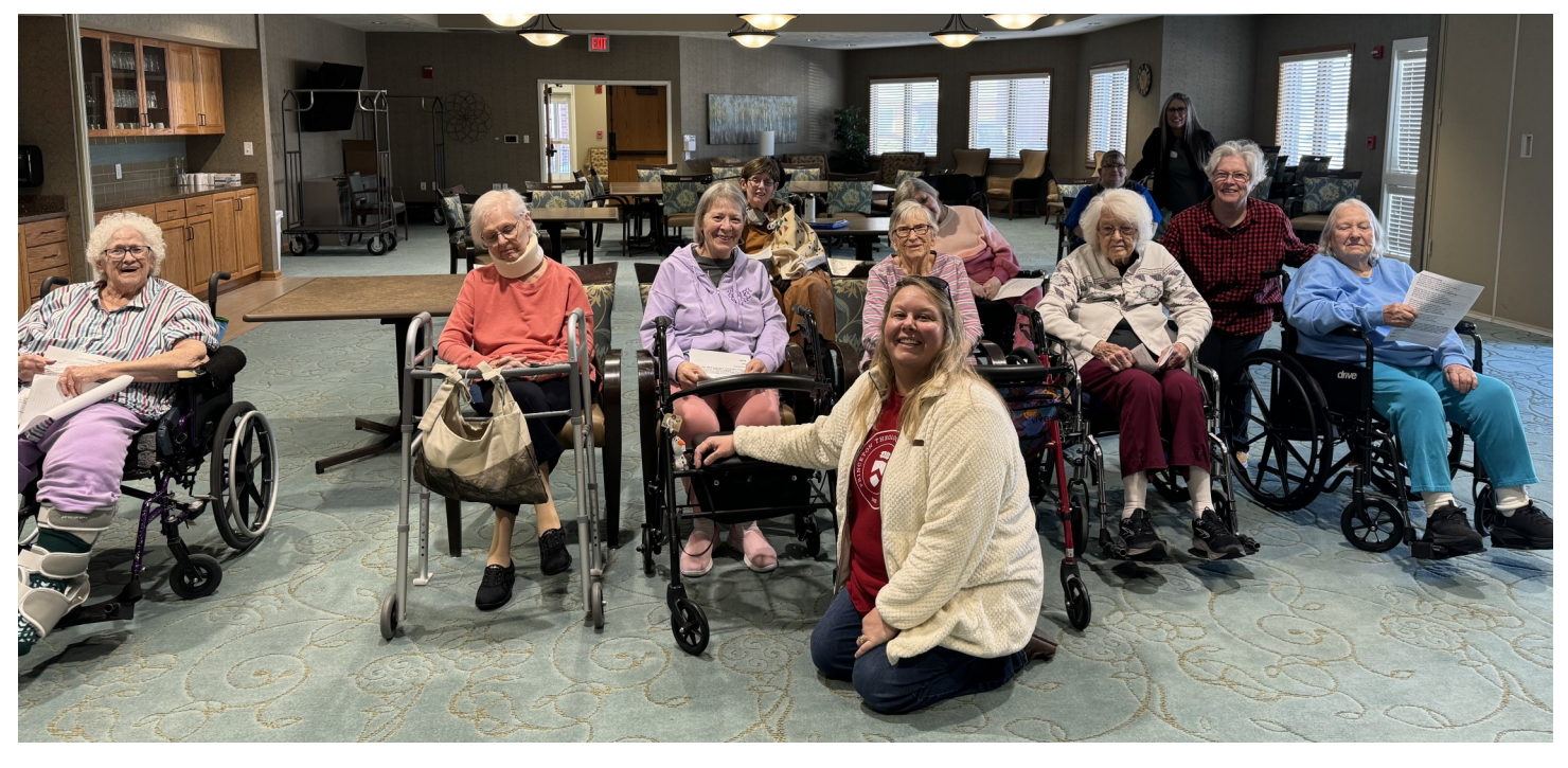
EASTER WORSHIP AT LINDEN COURT

Thank you to all who shared in the evening.