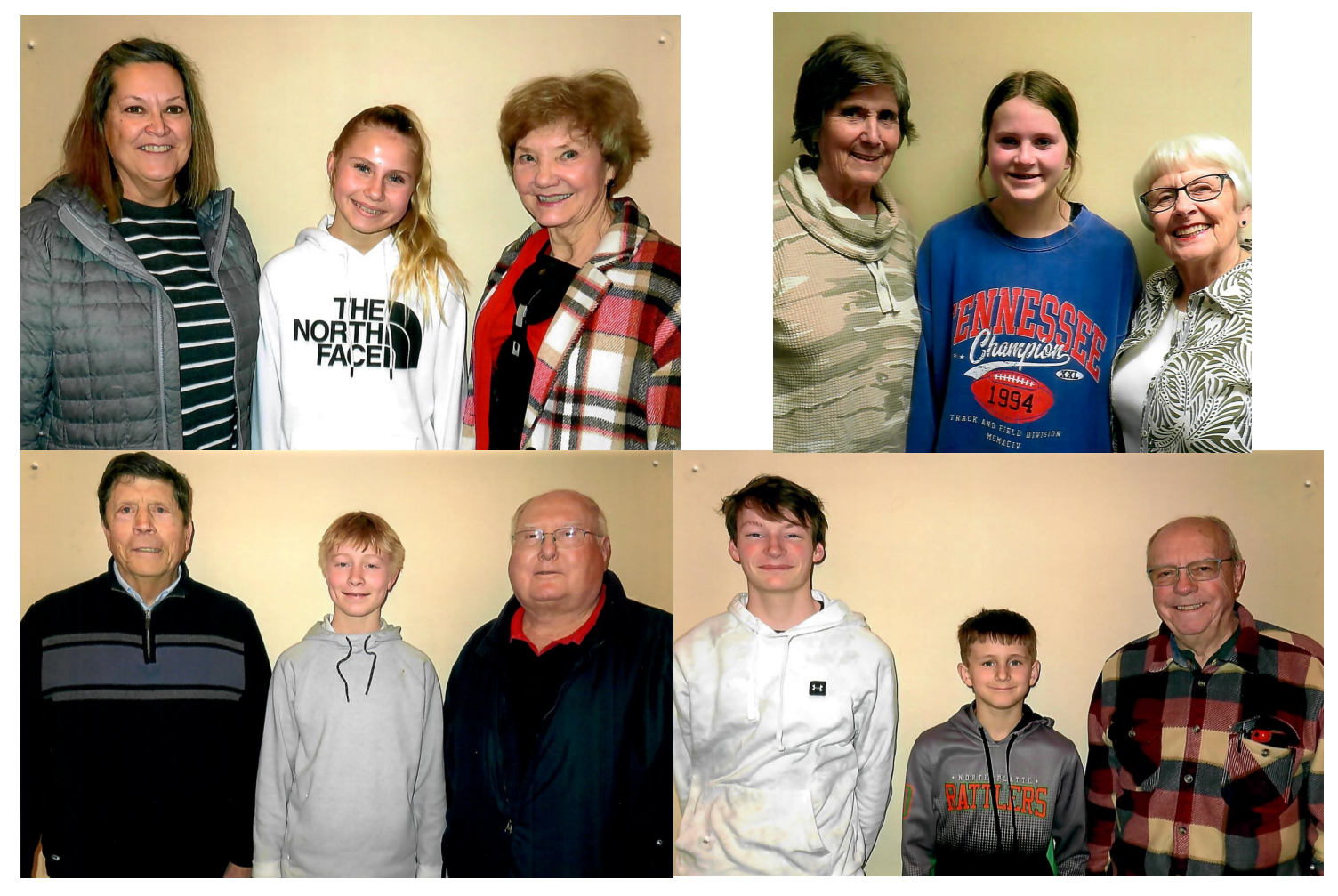
2024 CONFIRMANDS MEET WITH SESSION