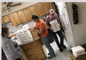
Deliveries being packed up for our homebound

We serve a hot meal every Thursday evening from 5:30-6:30pm in The United Methodist Fellowship Hall