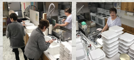
Any help is welcome!