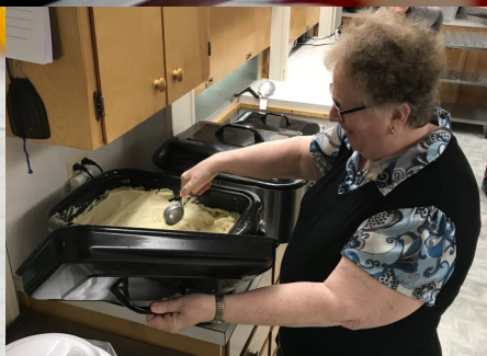
Warm food, warm company