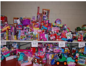
This is less than 1/12 th the amount of gifts needed for Kingsburg alone.

We don’t want to leave out a single deserving child! Please let us know now how you plan to help.