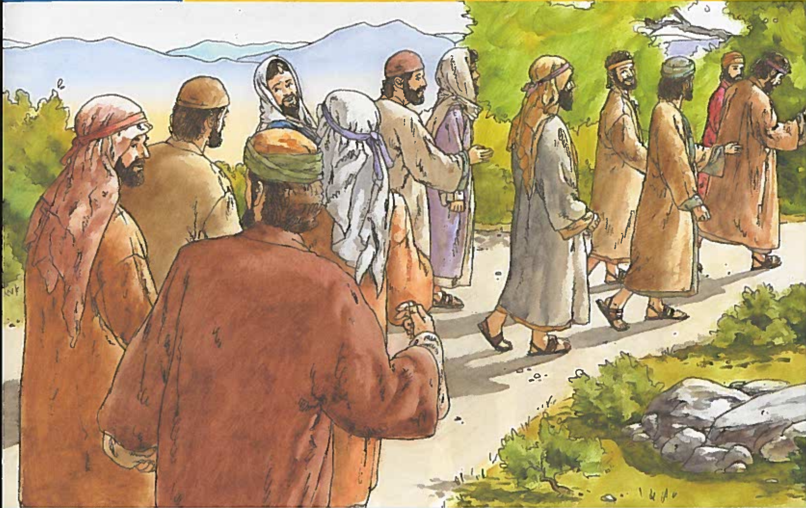
Illustration by Keith Neely