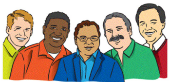
Area Men's Fellowship

We can bless people with the words of our mouth. We can speak life to them. The power of life and death is in the tongue. We can choose to speak life. When we edify or exhort, we are urging people forward. Just think of it, we can hold people back or urge them forward just by our words. “Death and life are in the power of the tongue; and they that love it shall eat the fruit thereof.” -Proverbs 18:21KJV