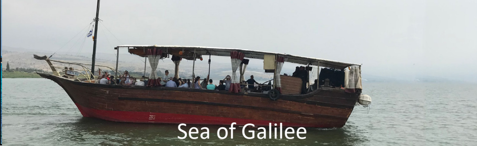
Sea of Galilee

Top Five Sites in Israel - is our current sermon series. In these five weeks you will hear from five of our church members who traveled to the Holy Land this past April. You will hear what their most memorable site in Israel was, and why. Let's journey together in the footsteps of Jesus as we learn from the land Jesus lived and walked on.