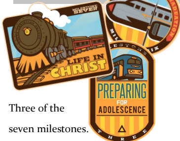
Three of the seven milestones.