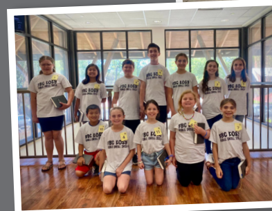
State Bible Drill at FBC Starkville!