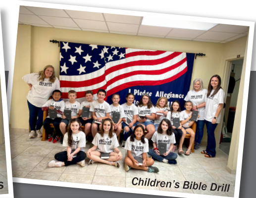
Children's Bible Drill