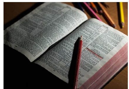
Men's Island Ministry Fellowship Thursdays at 8:00 am