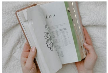
Women's Bible Study Thursdays at 10:30 am