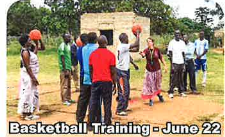
Basketball Training - June 22