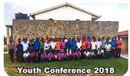
Youth Conference 2018