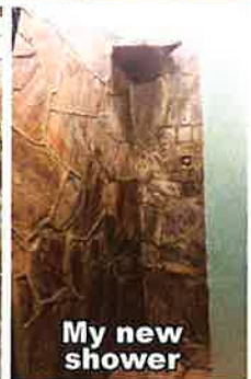
My new shower