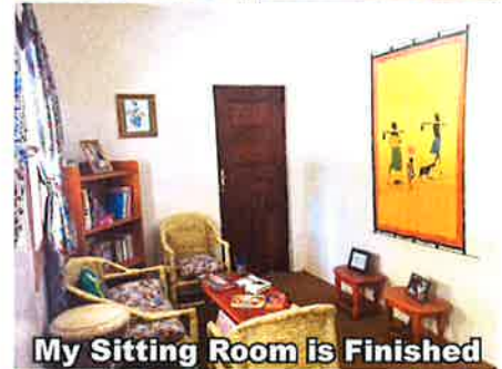
My Sitting Room is Finished