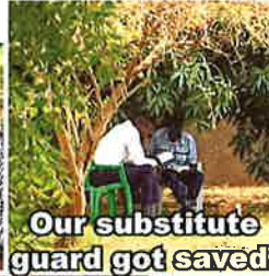
Our substitute guard got saved.