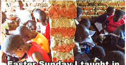
Easter Sunday I taught in two rooms at one time.