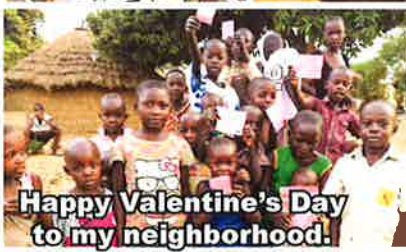
Happy Valentine's Day to my neighborhood!