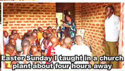
Easter Sunday I taught in a church plant about four hours away