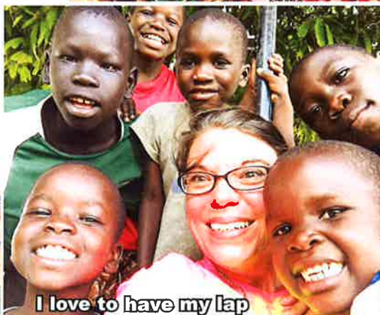
I love to have my lap full with my children