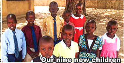
Our nine new children