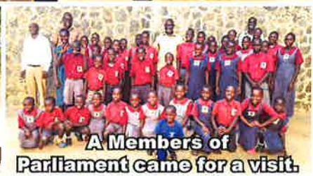
A Members of Parliament came for a visit.