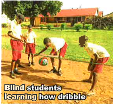
Blind students learning how dribble