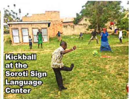
Kickball at the Soroti Sign Language Center