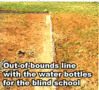
Out-of-bounds line with the water bottles for the blind school