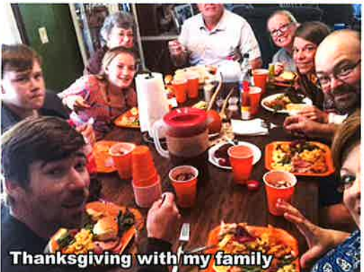
Thanksgiving with my family