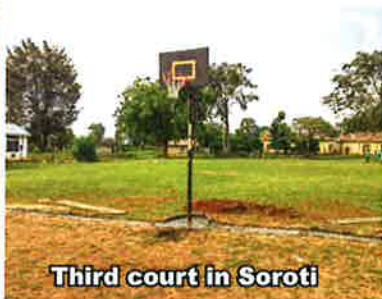
Third court in Soroti