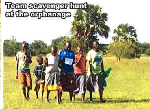
Team scavenger hunt at the orphanage