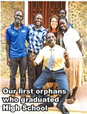
Our first orphans who graduated High School