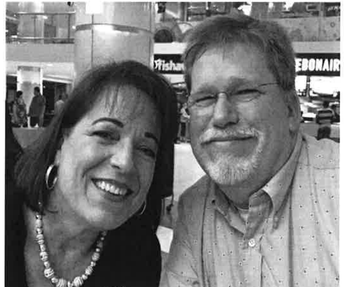
Celebrating our 29 th Anniversary!