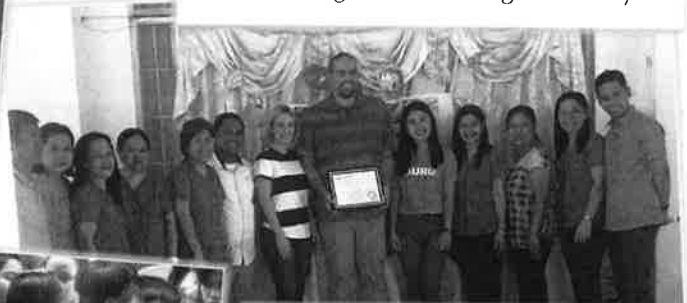
School administrators and teachers at the feeding center closing ceremony.