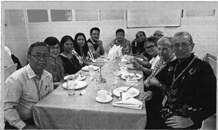
Indonesian delegation that attended the World Missions Conference in the Philippines.

The following week we attended the World Missions Conference held at Bethany Baptist Church Makati in Manila. The theme of the conference was NOW . As always it was impossible to not be inspired and challenged for world missions as you listened to the messages, heard the testimonies and witnessed the commitment of young missionaries determined to follow God's calling. In conjunction with this conference the Asian Baptist Clearinghouse received 29 new missionaries that will be carrying the gospel to people all around the world.