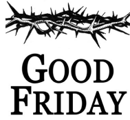
Good Friday April 19 7:30 p. m.