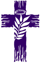
Palm Sunday April 14 10:00 a. m.