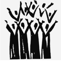
Christmas Cantata December 16 10 a. m.