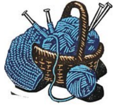
Prayer Shawl Group January 3, 2019 7 p. m.