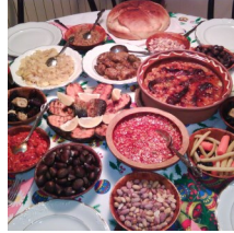
5th Sunday Brunch December 30, 2018 Fellowship Hall