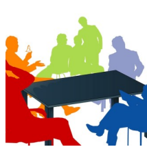
Hamden Plains UMC With the Bishop Tuesday; 7:30 p. m.