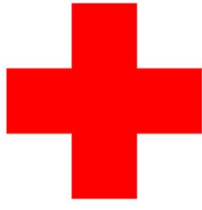
Blood Drive Tuesday; 1-6 p. m. Fellowship Hall