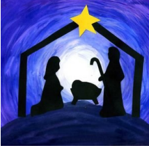
Road to Bethlehem Saturday; 5-8 p. m.