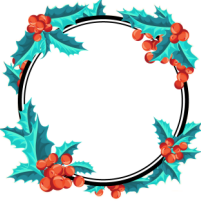
Hanging of the Greens This Sunday During Worship