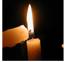
Candles and Carols December 24 5 p. m.