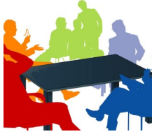
Finance Board Meeting Tuesday at 7:30 p. m.