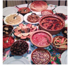
Consecration Sunday Nov. 18th. Luncheon to Follow Worship