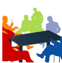
Church Conference Nov. 14 at 7 p.m. First UMC, Meriden