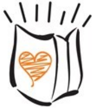
Lights of Hope November 10th Set-up 10 a.m.