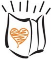
Lights of Hope November 10th Set-up 10 a.m.