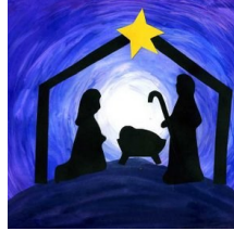
Road to Bethlehem After Worship, Sunday Room A