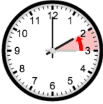
Daylight Saving Time Ends November 4th Clocks Back 1 Hour