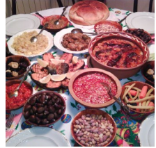
Consecration Sunday Nov. 18th. Luncheon to Follow Worship