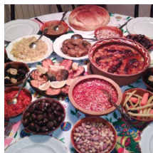
Consecration Sunday Dinner Following Worship