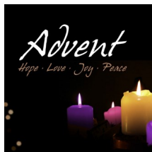
Advent Study Group Begins November 25th Sundays 5—6:30 p.m.