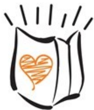
Lights of Hope November 10th