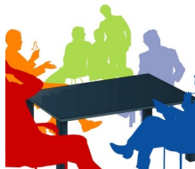
Church Conference Nov. 14th @ 7 p.m. First Meriden UMC