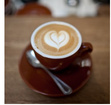
Something New February 26, 2019 11:00 a. m.