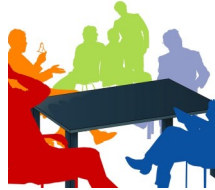
Church Council Meeting February 12, 2019 7:30 p. m.