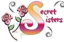
Secret Sister Reveal February 5, 2019 6-8:00 p. m.