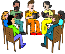
Pulpit Prep February 4, 2019 7:30 p. m.