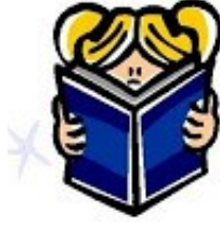
Booklettes January 24, 2019 7:30 p. m.