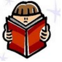
Men's Book Club January 24, 2019 7:30 p. m.