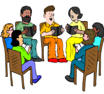
Pulpit Prep January 21, 2019 7:30 p. m.