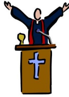
Pulpit Prep Resumes January 14, 2019 7:30 p. m.