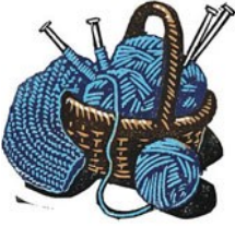
Prayer Shawl Group January 3, 2019 7 p. m.