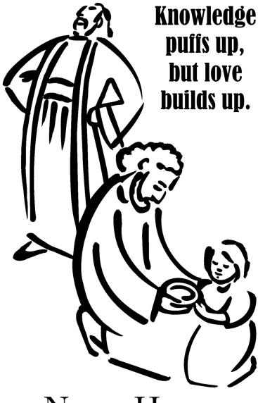
Never Happy: Things Could Be Better?