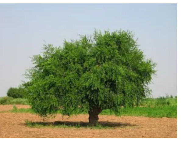
Small, Great Things