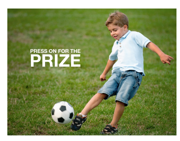
Staying At It