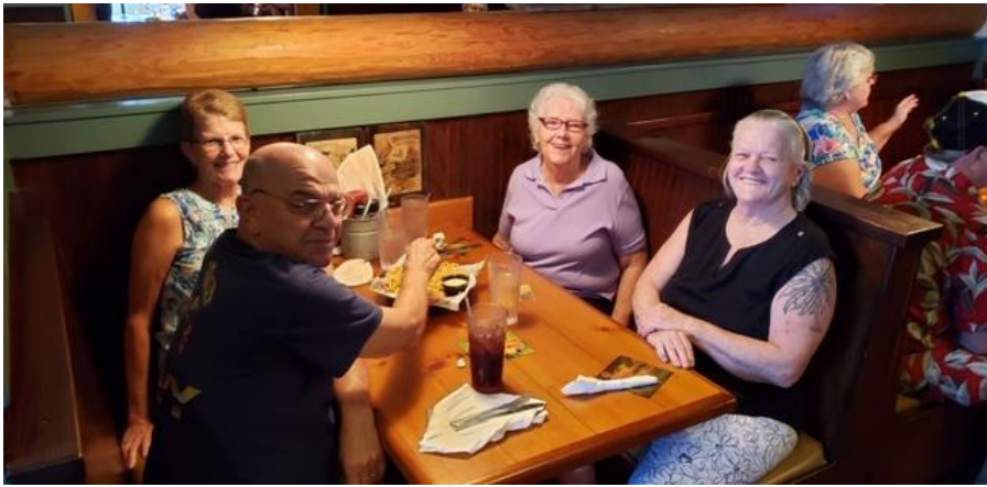
This Page: Lunch at RJ Gators