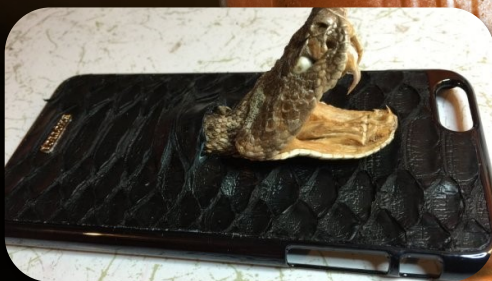
Rattlesnakes In the hands of our children