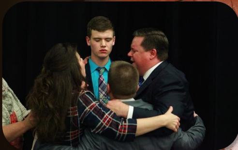
The Pastor's Wife Such a valuable price