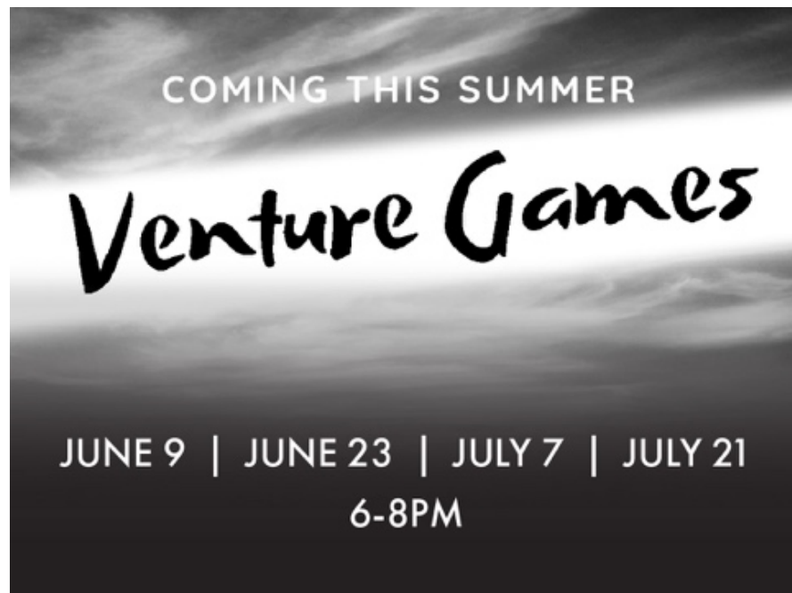
Summer VENTURE GAMES at St. Peter's 6-8pm