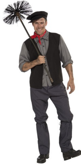
Dad's costume example