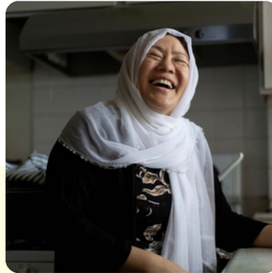
This event will reveal the stories behind the portraits. View the gallery January 24–31 on display in Jordan Hall.

Join us for this special event led by an Exodus staff member! You will: