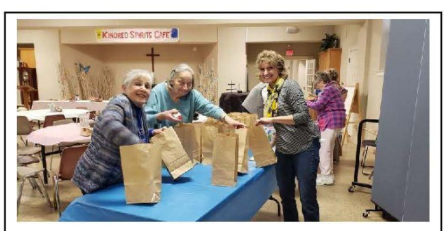
Kindred Spirits LL Packing Day - March 23, 2022