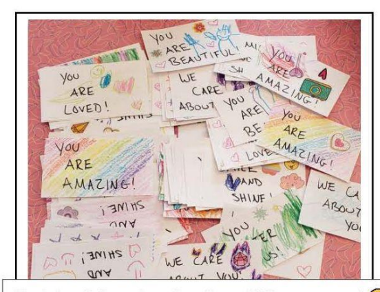
Each lunch has a handmade, uplifting care card 😊