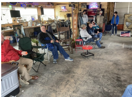
The Men’s Ministry Team held their Annual Spring Cookout. On April 22nd.

We would love to have you join us on May 12th for fellowship, food and discussion!