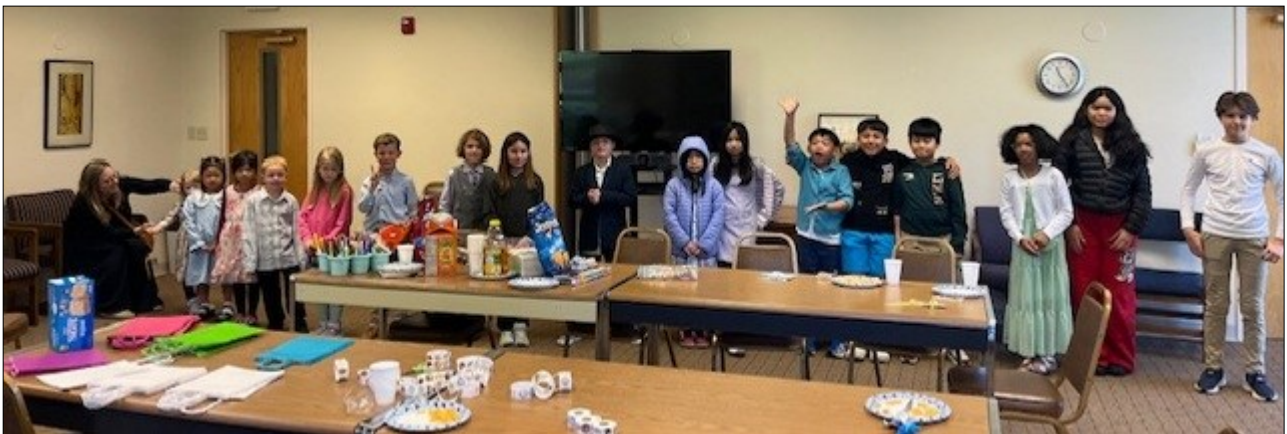
Our kids on Easter