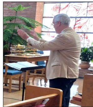
Singing the Hallelujah Chorus on Easter Sunday