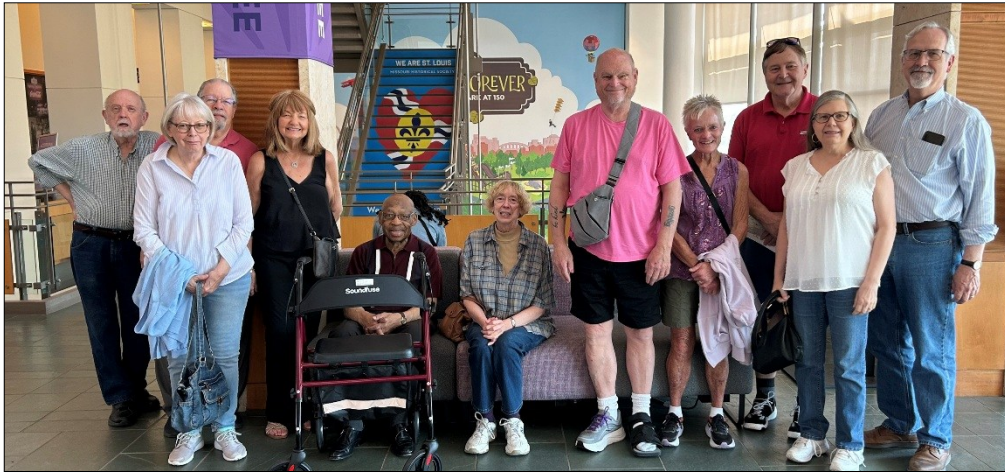
At the St. Louis History Museum