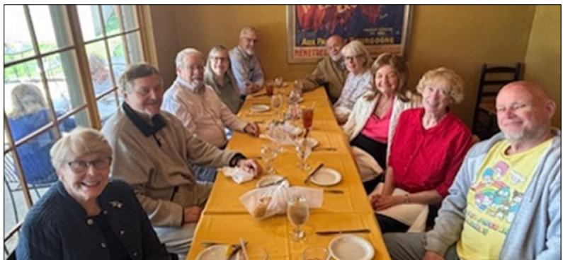
Lunch at Café Provençal in Kirkwood