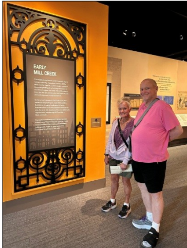
Mill Creek was a thriving predominately African American neighborhood in St. Louis. In the 1950s over 93% of it was destroyed to make way for commercial development and Interstate 64. Over 20,000 residents were displaced.