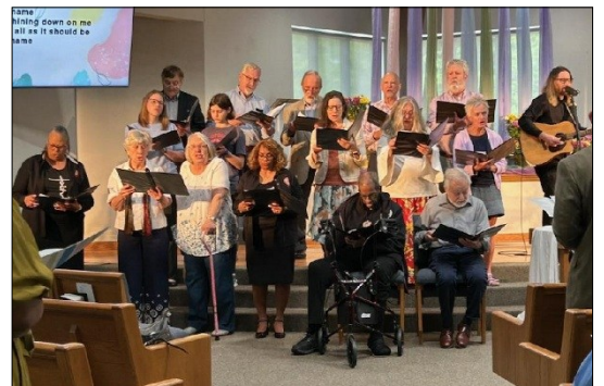
A choir made up of members of all three churches