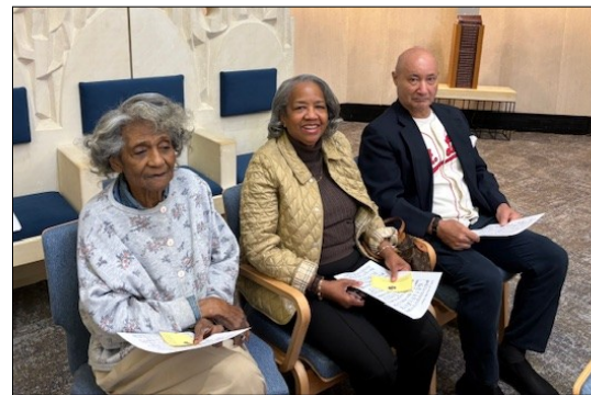
Participants in the service at St. Mary's Hospital