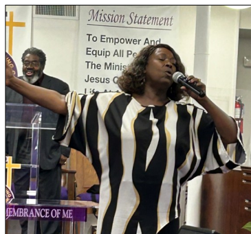
The soloist at Church of the Living God