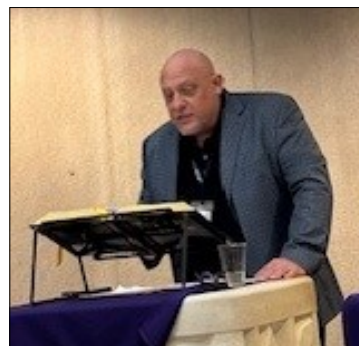
The St. Mary's Hospital chaplain spoke